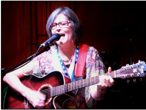
[Mississippi Songwriters Festival (2014)]