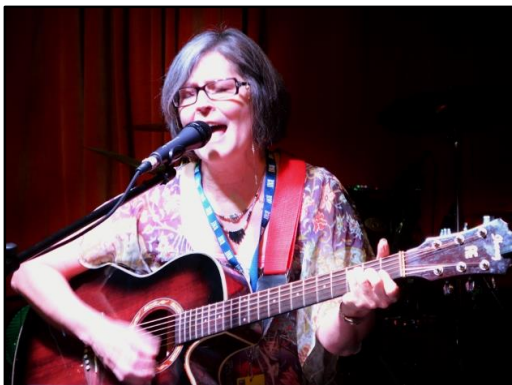
[Mississippi Songwriters Festival (2014)]